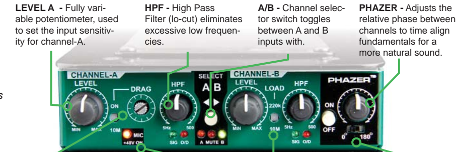
DRAG - Load correction used to set the desired impedance on the pickup for the most natural tone.