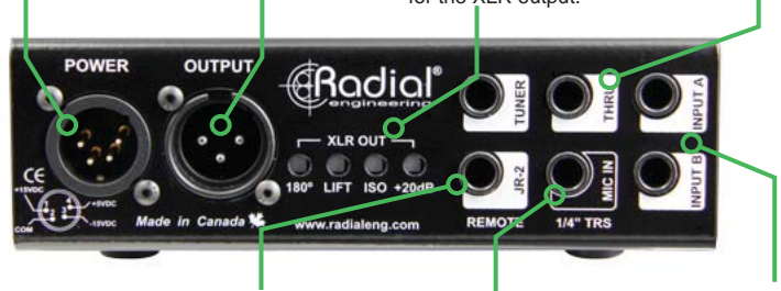
JR-2 REMOTE - Connection for optional JR-2 remote footswitch.

THRU - Unblanaced 1/4" thru-put used to feed the stage amp.